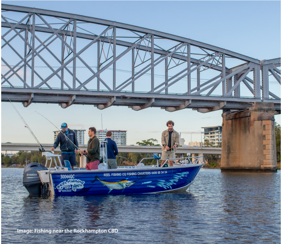
Image: Fishing near the Rockhampton CBD